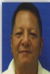
Hon. Leopoldo E. Ochia, CSEE Prominent Citizen