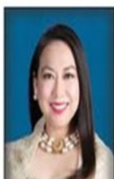
Hon. Dulce Ann K. Hofer Philippine Congress