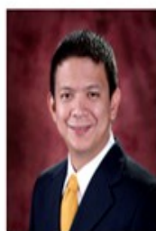
Hon. Francis G. Escudero Philippine Senate