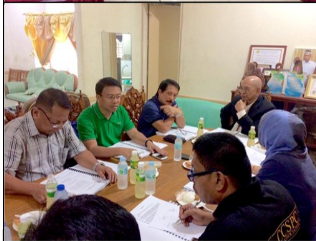
IT'S TIME TO DELIBERATE. BOT Meeting in Diliman Quezon City (top) and the conduct of Pre-Board Meeting, July 1 at the College President's Office (bottom).