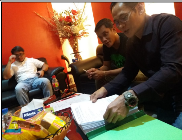
DELIBERATION the post-qualification

Cotabato City State Polytechnic College (CCSPC) Administrative Council recommended to the Board of Trustees (BOT) Resolution No. 010, s. 2017 concerning the issuance of notice of award in favor of Hytec Power, Inc. as a winning bidder for the supply and delivery of engineering laboratory equipment with P10 million as its Approved Budget for the Contract (ABC) eventually approved thru Resolution No. 253, s. 2017 during the 3 rd Regular Board Meeting, Sept. 13 in Diliman, Quezon City.